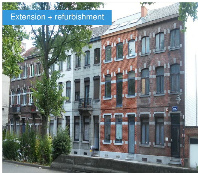
Extension + refurbishment

by Elie Delvigne / 2014-12-01 07:44:42 / Belgique / 19107 / FR