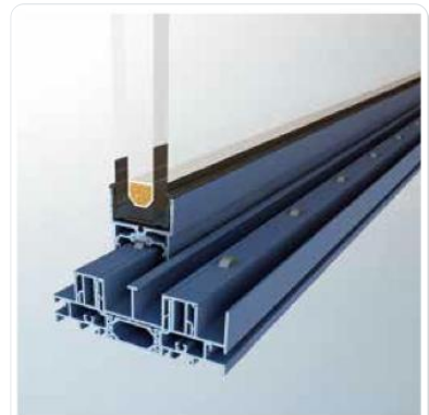
Los rodamientos continuos soportan hasta 600 kg por hoja

OK. It has allowed to perform a carpentry with minimum framework thicknesses while maintaining low thermal conductivity and low leakage. This is sought to give great visual breadth to the environments in a narrow estate.