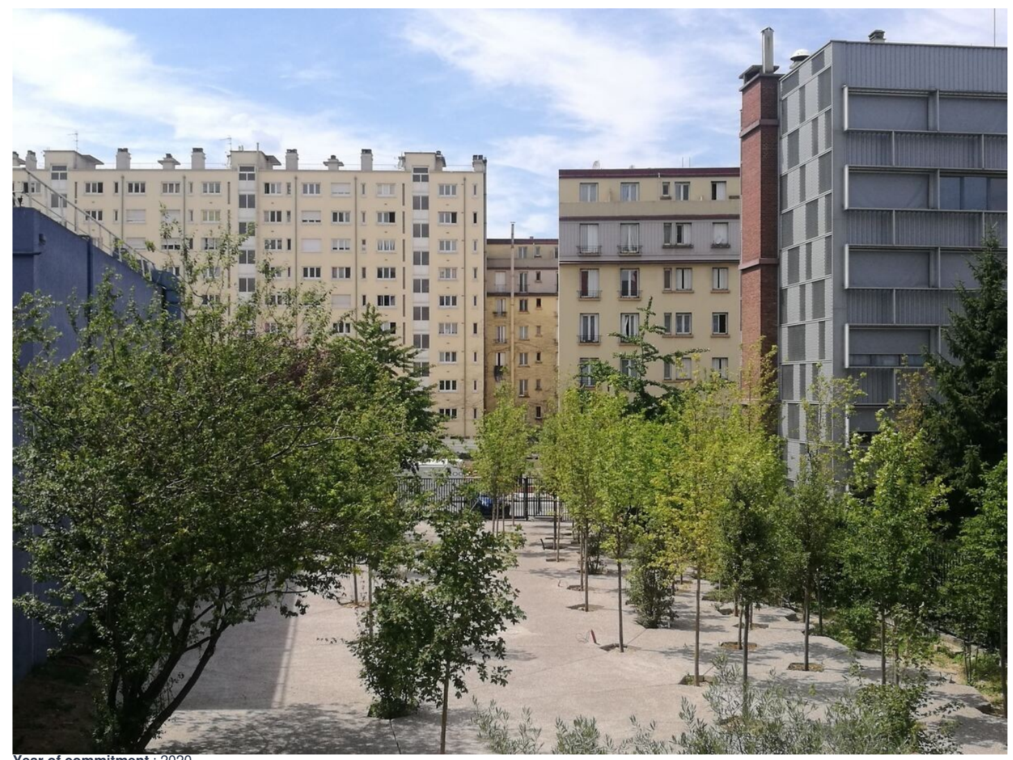
Year of commitment : 2020 Address 1 - street : 51 rue de la Commune de Paris 93300 AUBERVILLIERS, France Diameter : 50

^{\scriptsize (0)} 6956 Last modified by the author on 25/03/2021 - 16:46