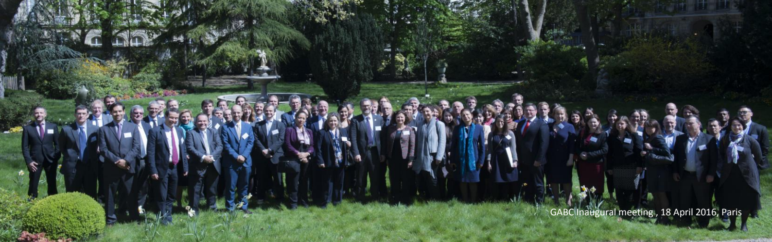
GABC Inaugural meeting , 18 April 2016, Paris