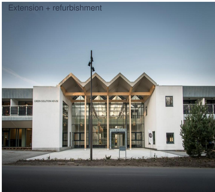
Extension + refurbishment

Last modified by the author on 24/07/2015 - 10:23