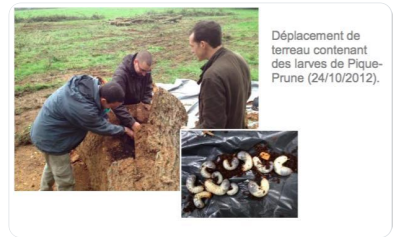
Déplacement de terreau contenant des larves de Pique-Prune (24/10/2012).