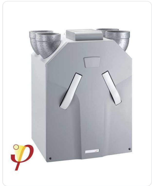
Jolly Fenix Floor