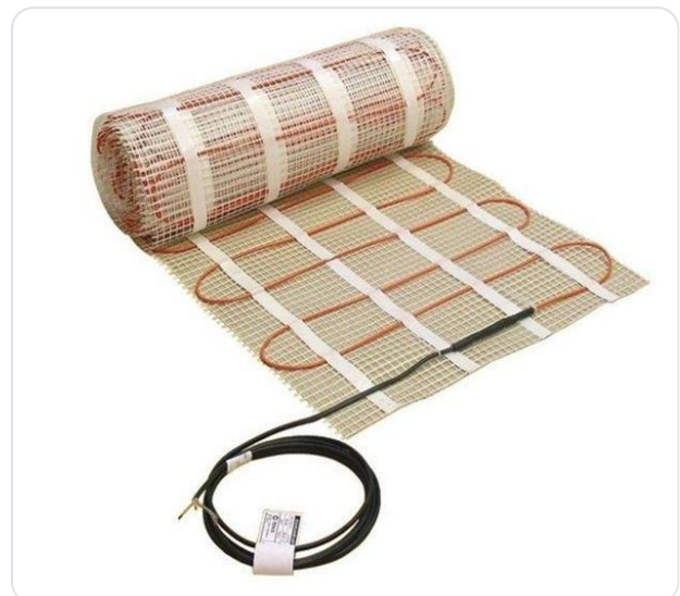
Jolly Vario Therm