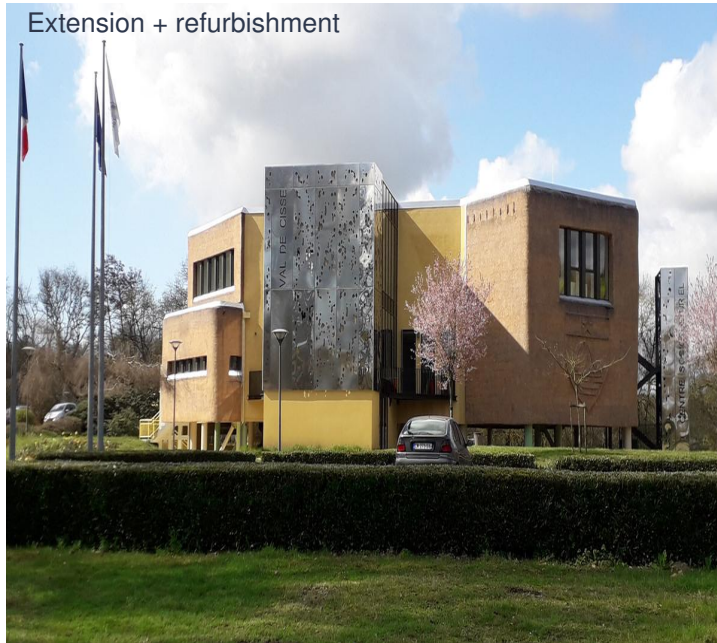
Extension + refurbishment

Last modified by the author on 05/06/2019 - 14:14