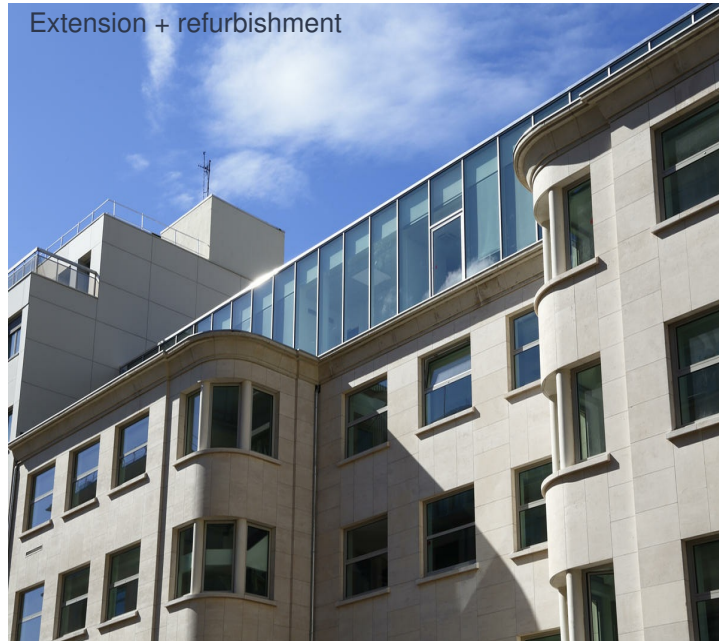
Extension + refurbishment

Last modified by the author on 14/06/2016 - 15:44