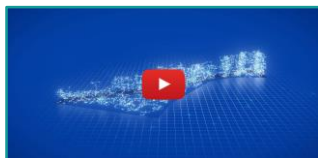
Optimal Solutions, the double Smartgrid Nanterre Cœur d'Université ©Ramdam