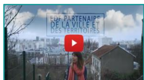
EDF, partner of cities and territories

This allows our customers to have a forward-looking view , benefiting from expert solutions and relevant advice. They thus have access to efficient energy services that are adapted to many different situations and needs, in the service of a carbon-free performance .