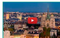
Citelum, the connected management project of public space in Dijon, France