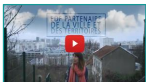
EDF, partner of cities and territories

This allows our customers to have a forward-looking view , benefiting from expert solutions and relevant advice. They thus have access to efficient energy services that are adapted to many different situations and needs, in the service of a carbon-free performance .