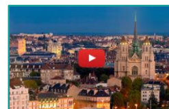
Citelum, the connected management project of public space in Dijon, France