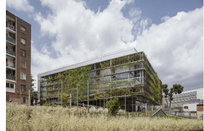
Turo de la Peira – @Enric Duch