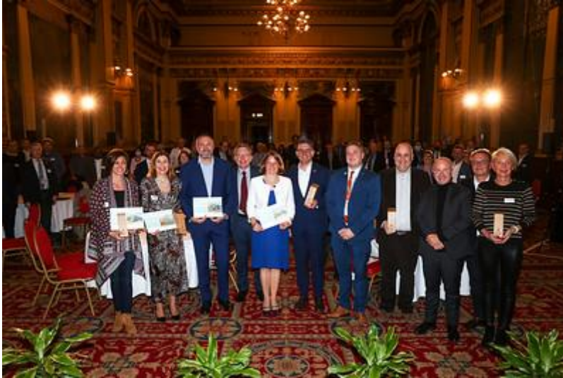
The international winners at the awards ceremony in Glasgow in the presence of Barbara Pompili, then French Minister for Ecological Transition