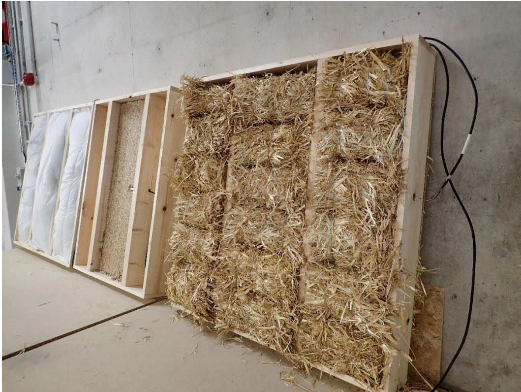
Figure 3: Picture of the three full-scale prototypes as deployed at the partner University of Bath's large Environmental Chamber.